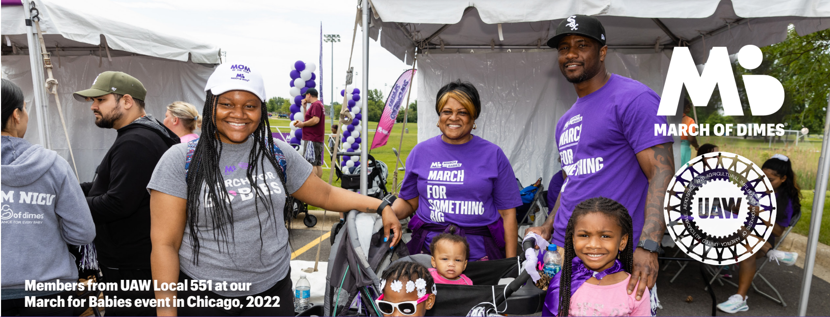
Members from UAW Local 551 at our March for Babies event in Chicago, 2022